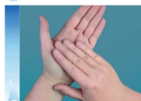
6 Rub each palm thoroughly