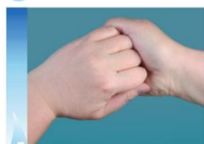
4 Rub fingertips and fingernails of both hands together thoroughly