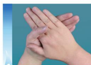
1 Rub hands palm to palm

Repeat each step of the hand washing procedure at least five times