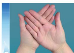
2 Rub right palm over left dorsum and vice versa