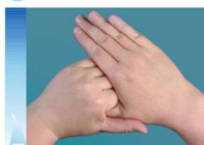
5 Rub thumb of each hand thoroughly